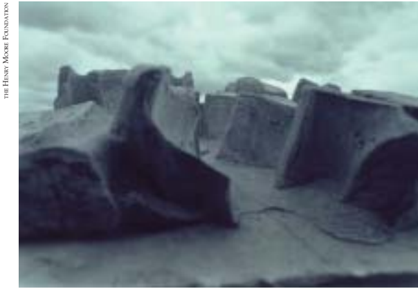
Stone Maze: Project for Hill Monument by noted sculptor Henry Moore can be seen at the Frederik Meijer Gardens and Sculpture Park in Grand Rapids through April

A Publication of Michigan Humanities Council - January 2005