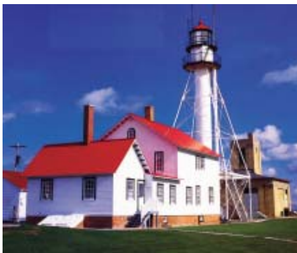
The Great Lakes Shipwreck Museum at Whitefish Point will open a new exhibit in May 2006, Interpretive Panels: U.S. Coast Guard Surfboat House.

The Kalamazoo Symphony Orchestra (KSO) has been awarded a $7,500 grant for "The World of... Beethoven." This is a collaborative project involving the KSO, Kalamazoo College, the Kalamazoo Public School District, and the Decatur Public School District. A Musicians-in Residence component for 3 rd and 4 th graders at three Kalamazoo Public Schools (Winchell, Woods Lake, and King-Westwood) will concentrate its spring 2005 academic semester on Beethoven as part of its Great People/Overcoming Challenges KSO curriculum-integrated education program. Students and families will be invited to a public KSO concert entitled "The World of... Beethoven" on April 17 at 3 pm at Kalamazoo College's Light Fine Arts Center, with rebroadcast on WMUK radio. A modified performance of "The World of... Beethoven" will take place on April 19 at 7:30 pm at the Decatur Middle School Theatre. A companion booklet about the life and times of Beethoven will be created and made available to all students and attendees.