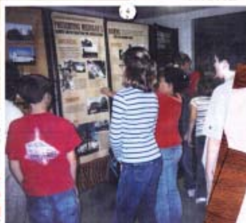
The Michigan Barn Preservation exhibit was popular with students