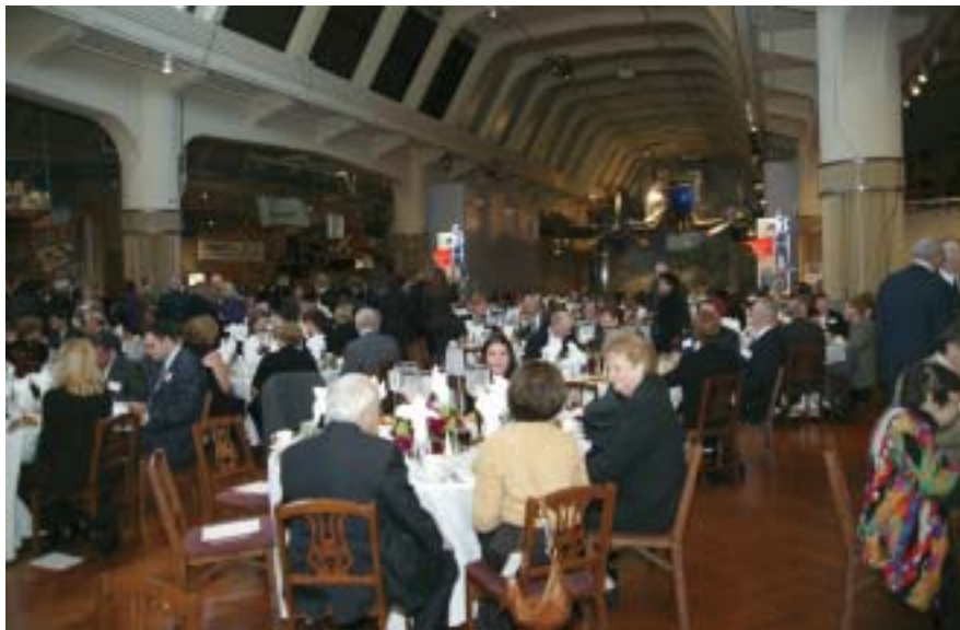
The main floor of the Henry Ford Museum in Dearborn served as the location for the Michigan Humanities Council's 30th Anniversary Celebration. More than 300 individuals participated in the event on September 30, 2004.