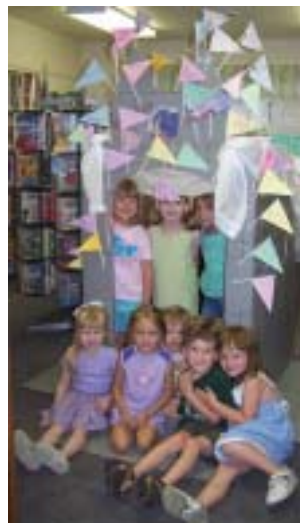
In 2005, "Read for Rewards" involved 1,200 students at Mount Pleasant's Chippewa River District Library. MHC supported the program with a library literacy grant.

June through July 2005. Rewards — including gift certificates from local businesses — were given to students who completed novels within the program period. Participants were also encouraged to create artwork inspired by their readings, which was publicly displayed at the library.