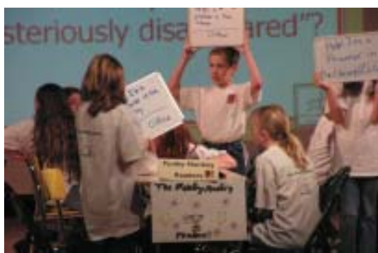
The Houghton Lake Public Library (HLPL) developed a "Battle of the Books" competition with fourth and fifth graders competing in summer of 2005. The team Maniac Monkeys from HLPL defeated Miss "No" It Alls from the Gerrish-Higgins School District Library for the championship.